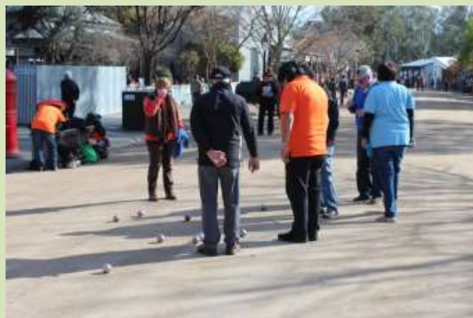
Playing at the 2015 Echuca Murray Maul